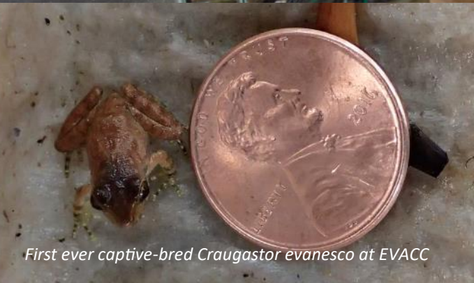
First ever captive-bred Craugastor evanesco at EVACC