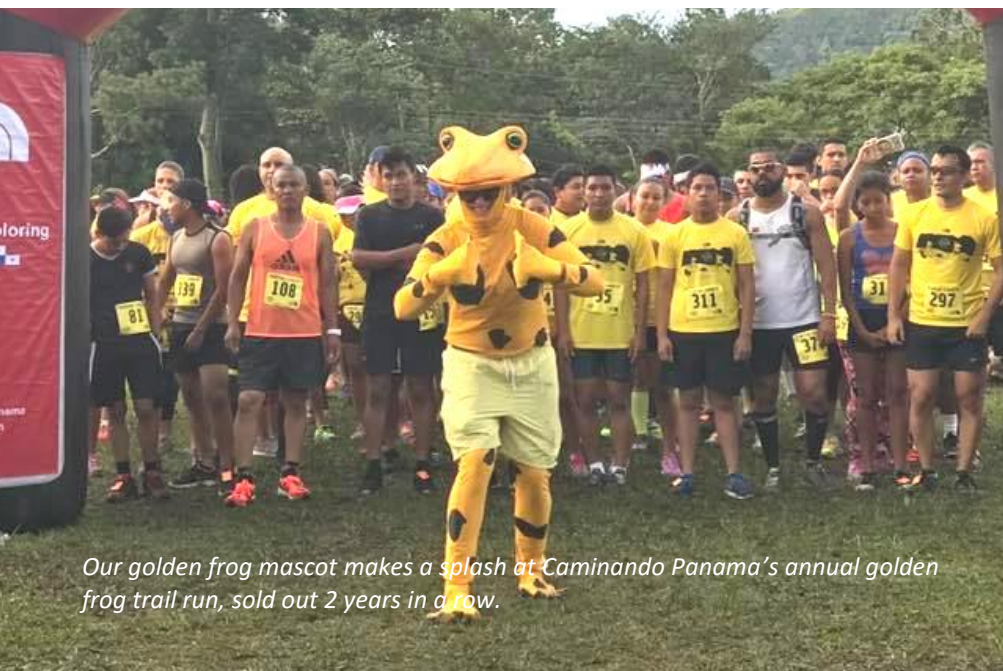
Our golden frog mascot makes a splash at Caminando Panama’s annual golden frog trail run, sold out 2 years in a row.

Eleven independent English and Spanish news stories covering our project appeared in 2015 with more Spanish news articles than English. Our online constituency continued to grow steadily. We now have 4,800 twitter followers, 11,000 Facebook fans, 6,000 instagram Instagram followers. Website visitors dropped 6% compared to last year with 38,000 unique visitors (about 9,000 of these were Spanish-speaking visitors).