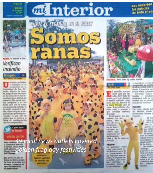
49 local news outlets covered golden frog day festivities