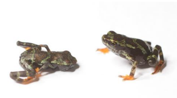
Spindly leg froglet (left) vs healthy froglet (right)

We conducted research into spindly leg syndrome which is a major rate-limiting factor affecting our production of frogs. We investigated water quality, diet composition and ration as potential factors associated with the syndrome.