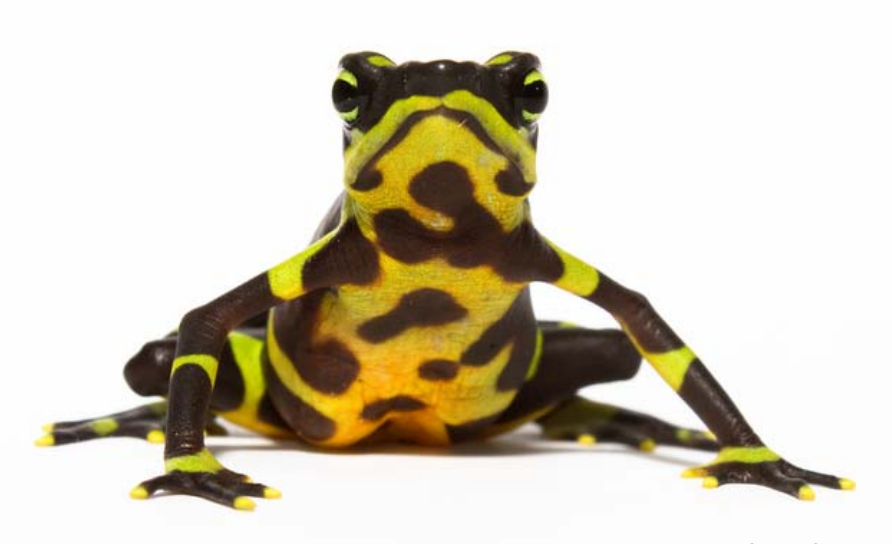
Atelopus limosus, the Limosa harlequin frog.